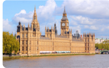
Houses of Parliament

London is a city. It is the largest settlement in the United Kingdom. Over eight million people live there. The River Thames is the main river that runs through the city. Tourists visit London to shop and see its famous landmarks.