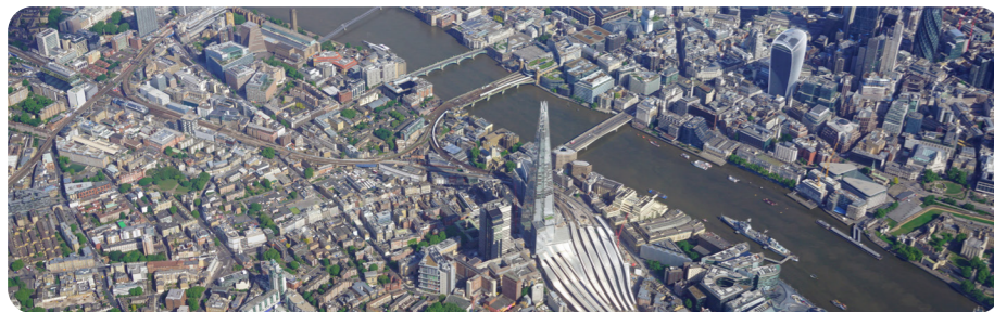
Aerial view of London

A city is a large, busy settlement where lots of people live and work. A city usually has a cathedral, a river, important buildings and offices where people work. There are lots of things to see and do in a city. There are many shops and restaurants to visit.