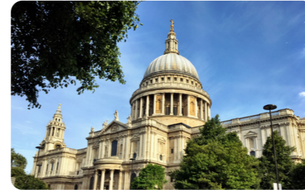
St Paul's Cathedral