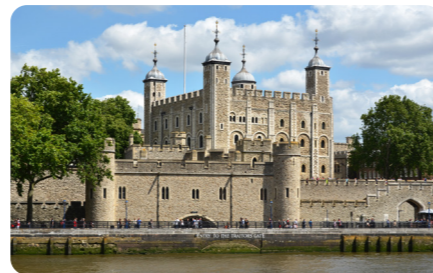
Tower of London